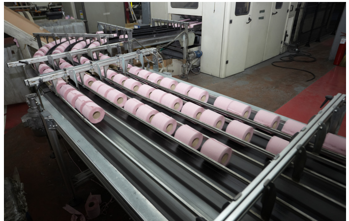
Magnaplate HCR® fortifies aluminum parts with an ultra-hard, corrosion resistant and non-stick surface.

Solution: The company's packaging engineer reduced the arm size and had Magnaplate apply PLASMADIZE to the chute's bottom and sides, quickly resolving wear and friction problems and restoring packaging output.