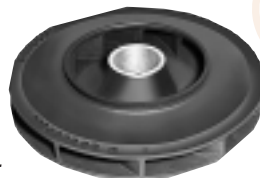
Aluminum impeller, up to 6' diameter, is protected against abrasion, corrosion, friction and drag.