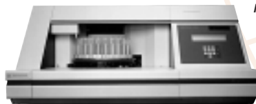
MAGNAPLATE HCR solved problems of wettability and of corrosion from acidic and alkaline reagents on the aluminum carousel and slide platforms on computerized immunostaining equipment.