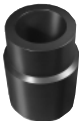
Aluminum under-sea sonar collar is protected against salt water corrosion during oil explorations.