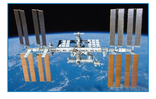
HI-T-LUBE can be applied to a variety of parts on NASA, private and commercial spacecraft, such as solar arrays, to prevent corrosion, abrasive wear, and galling in the harsh environment and extreme temperatures of outer space.