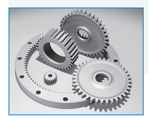
HI-T-LUBE is recommended for use on all types of gears and gear assemblies to prevent abrasive wear under heavy loads at both high and low temperature extremes.