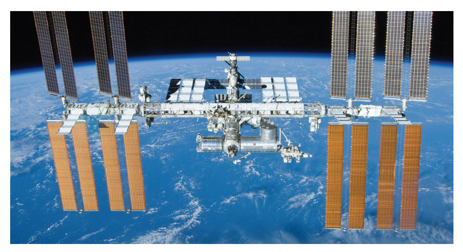
Countless NASA vehicles sent into space have used parts coated by Magnaplate, including the parts on the International Space Station (ISS).

Aerospace and airframe manufacturers know how difficult it is to design components that can withstand extreme environments while providing corrosion and wear protection. Making things even more complicated is the need to comply with international standards, such as REACH. While engineers favor composites, aluminum, titanium and magnesium for their light weight, most of these metals are highly susceptible to corrosion if left unprotected. Synergistic surface enhancement coatings can help address and ultimately overcome these challenges.