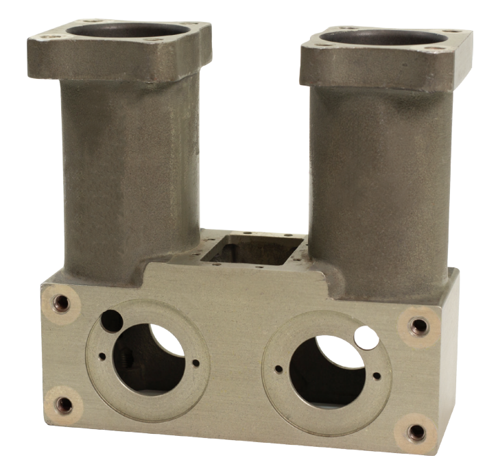
Synergistic coatings protected the fuel-mixing control valves on the LEM Ascent Engine of Apollo 13.