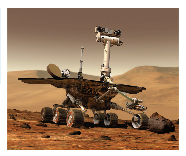
In 2004, Magnaplate played a critical role in the Mars Rover landing by providing coatings for the landing mechanism.

The metal components used in space systems and other aerospace applications must be able to withstand corrosion, wear, friction and thermal extremes. At the same time, companies are looking to replace heavy metals in keeping with strict international standards, as well as save time and money with permanently lubricated solutions that cut down on maintenance costs. Since the very first NASA space missions, synergistic coatings have been up to the challenge, offering corrosion and wear resistance, dry lubrication, thermal tolerance and REACHcompliant protection for steel, aluminum, titanium and other super alloy components.