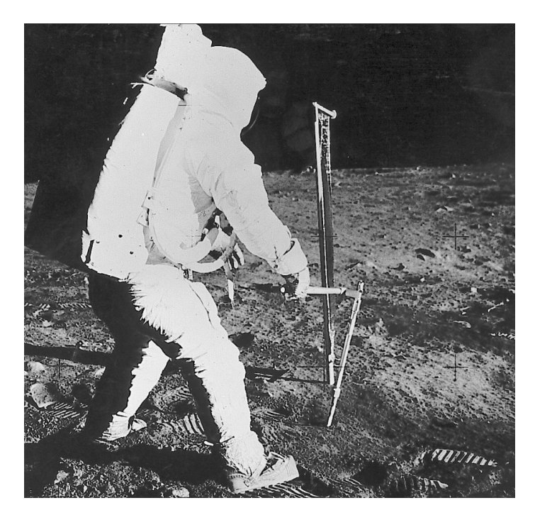
Contamination can occur from moon surface samples by titanium particles and other foreign materials. Applying synergistic coatings to these drill tubes can make the surfaces abrasion-resistant and permanently dry-lubricated.

Today the Company is ISO certified, NADCAP accredited and ITAR complaint and its coatings are REACH compliant.